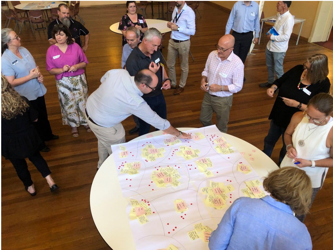
Figure 2: Yorke Peninsula and Mid North Visioning Workshop held at the Clare Town Hall on 23 February 2023