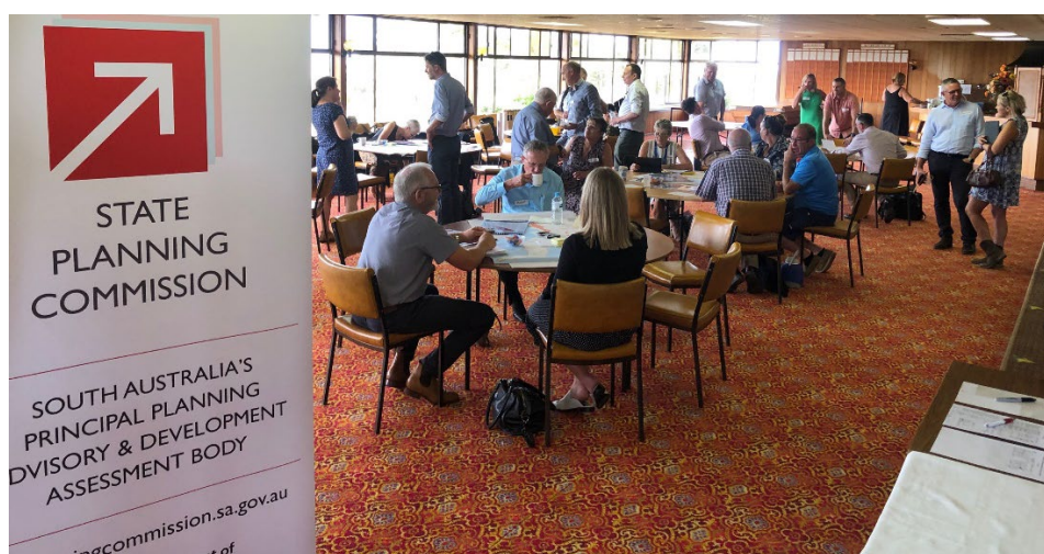
Figure 1: Key stakeholders engaged in the Maitland Visioning Workshop held on 24 February 2023.

To date pre-workshop engagement activities, designed to inform councils, state agencies and key industry representatives, have been conducted by the Department. The Yorke Peninsula & Mid North Visioning Workshops were held on the 23 rd (Clare) and 24 th of February (Maitland), where representatives from the local councils, key industry organisations, departments and progress associations were present. The workshops were led by the State Planning Commission, Planning and Land Use Services and Department of Premier & Cabinet. 54 key stakeholders were in attendance and provided invaluable knowledge of the Yorke Peninsula & Mid North region, by exploring how the various communities will be shaped, live, and grow over the next 30 years. The information collected during the Visioning Workshops will play a critical role in shaping the Yorke Peninsula & Mid North Regional Plan.