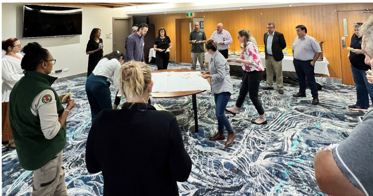
Figure 2: Eyre and Western Visioning Workshop held in Ceduna on 29 March 2023