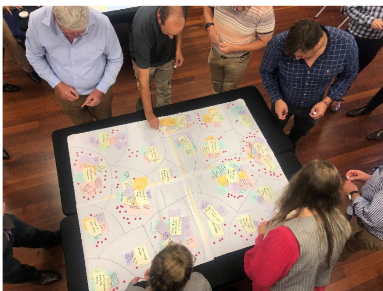
Figure 1: Key stakeholders engaged in the Eyre and Western Visioning Workshop held in Port Lincoln on 27 March.

the various communities will be shaped, live, and grow over the next 30 years. The information collected during the Visioning Workshops will play a critical role in shaping the Eyre and Western Regional Plan.