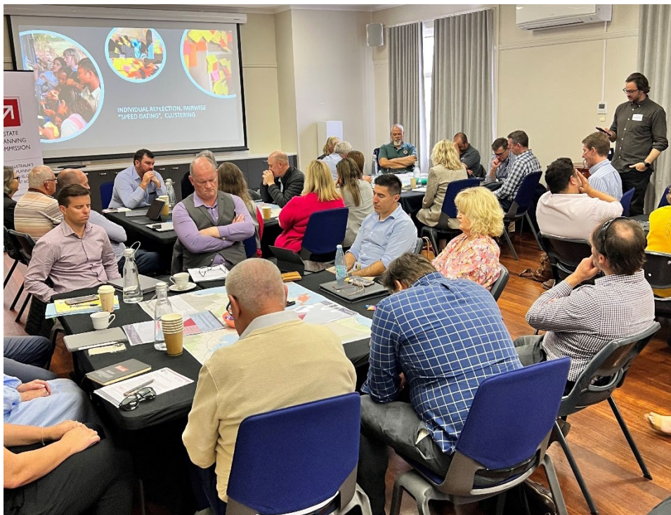
Figure 2: Key stakeholders engaged in a visioning exercise in Port Lincoln on 27 March.