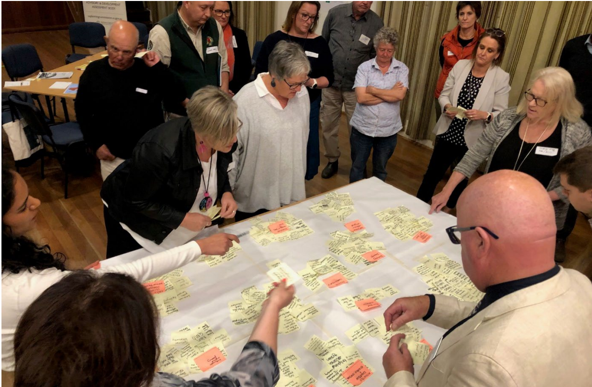
Figure 2: Kangaroo Island Visioning Workshop held at the Kingscote Town Hall on 9 Dec