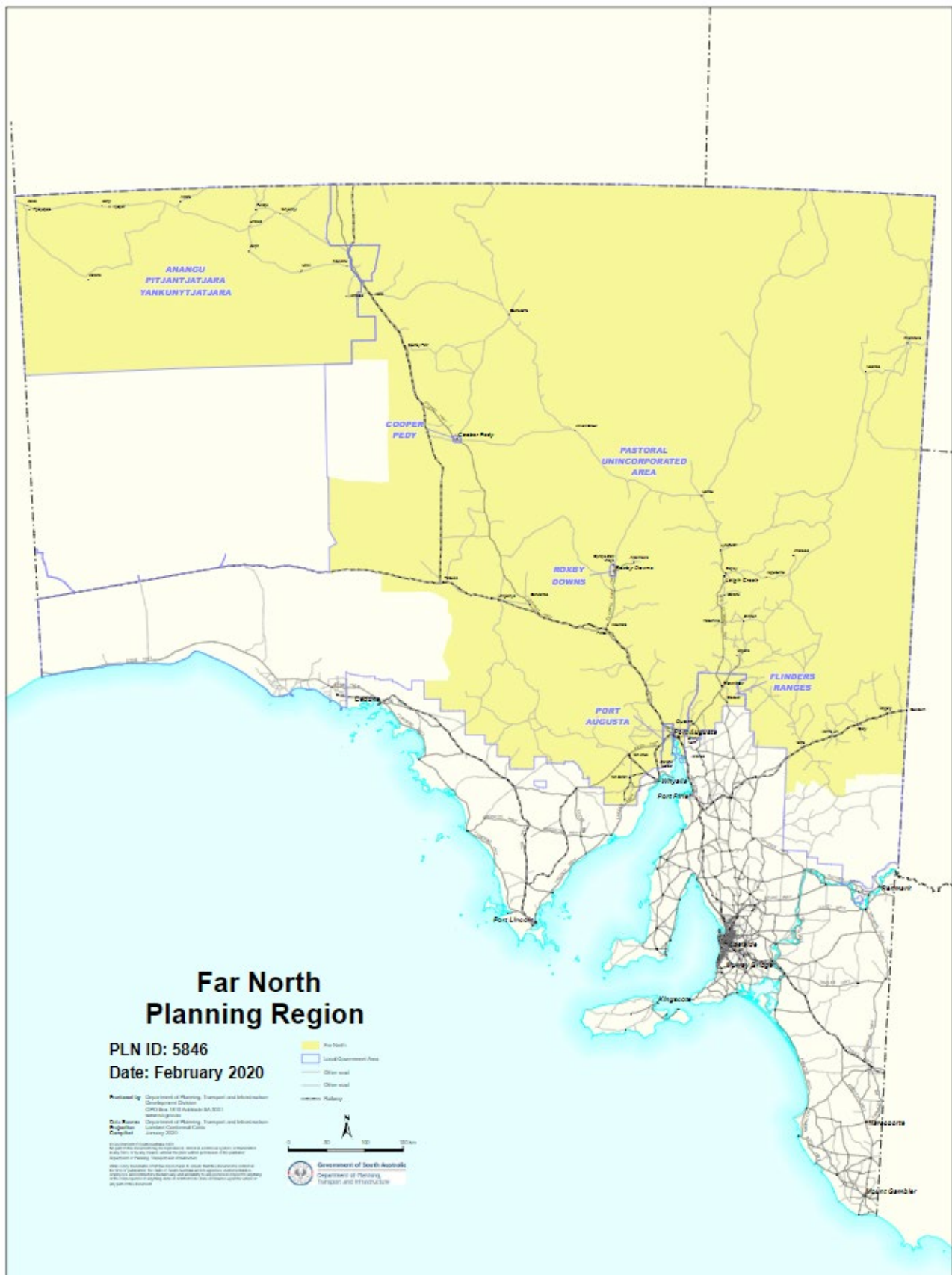
Figure 1. Far North Planning Region.