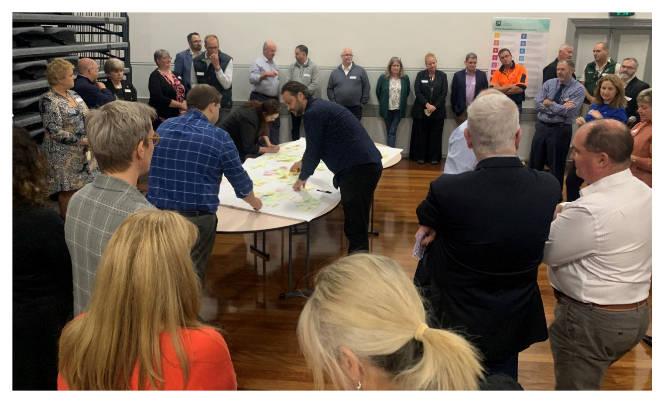
Figure 2: Limestone Coast Visioning Workshop held at the Naracoorte Hall on 7 March 2023