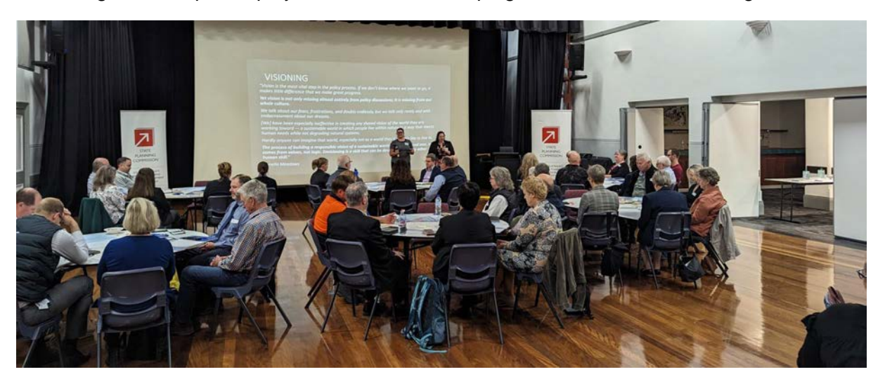
<u>Figure 1</u>: Key stakeholders engaged in the Limestone Coast Visioning Workshop held on 7 March.

To date pre-workshop engagement activities, designed to inform councils, state agencies and key industry representatives, have been conducted by the Department. The Limestone Coast Visioning Workshop was held on the 7<sup>th</sup> of March in Naracoorte, where representatives from the Limestone Coast councils, key industry organisations, state government agencies, non-government organisations and progress associations were present. The workshops were led by the State Planning Commission, Planning and Land Use Services (PLUS) and the Department of Premier and Cabinet. 41 key Limestone Coast stakeholders were in attendance and provided invaluable knowledge of the Limestone Coast region, by exploring how the various communities will be shaped, and how they will live and grow over the next 30 years. The information collected during the Visioning Workshops will play a critical role in shaping the Limestone Coast Regional Plan.